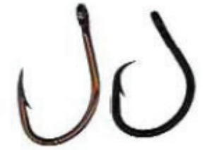
J-hook (left) and circle hook (right).